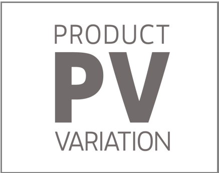
Other colours and specifications available on request