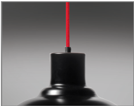
RC / Red braided cable