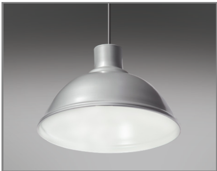
G / Grey satin outer, white satin inner