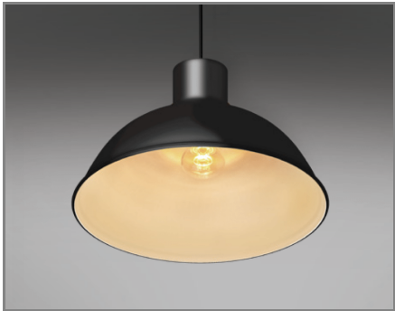
126.002 Warm dim (E27)