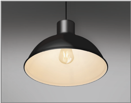
126.003 Dimmable (E27)