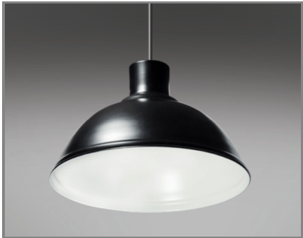
B / Black satin outer, white satin inner