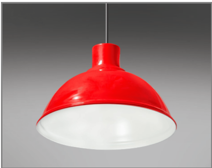
R / Red gloss outer, white satin inner