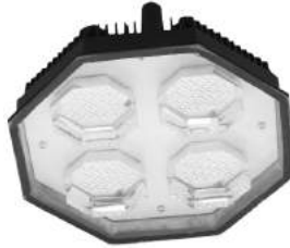
Clear polycarbonate (PC)