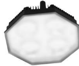
Opal polycarbonate (PCO)