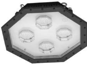
Clear hardened glass (standard)(KC)