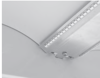
LED MODULES ON COOLING PLATE