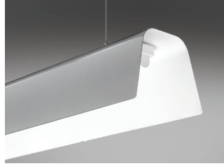
/G Grey satin outer, white satin inner