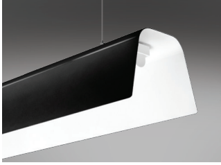
/B Black satin outer, white satin inner