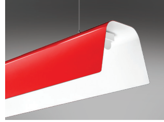
/R Red gloss outer, white satin inner